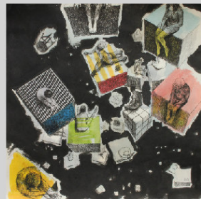
floating island, 2019 mixed media on paper, framed 25 x 25 / 40 x 40 cm

ART ON PAPER Brussels International Drawing Fair