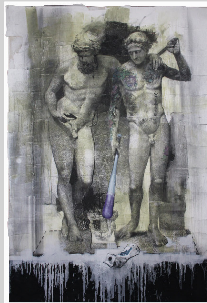
Vollmilch, 2018 mixed media on paper mounted on cotton fabric / stretcher frame 250 x 170 cm

Viktors Svikis presents direct portrayals of strength, power, and violence in everyday settings with the finesse of an old master who uses pop-cultural language and paints collage-like everyday situations with varied and sometimes confusing themes. Svikis amalgamates alienating motifs and realities with subversive humor. Without judging, he tries to analyze what moves humanity.