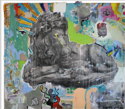
Das Lamm, 2017 mixed media on paper mounted on cotton fabric / stretcher frame 150 x 170 cm

VIKTORS SVIKIS 1978 born in Riga, Latvia Lives and works in Vienna / Austria www.svikis-viktors.net